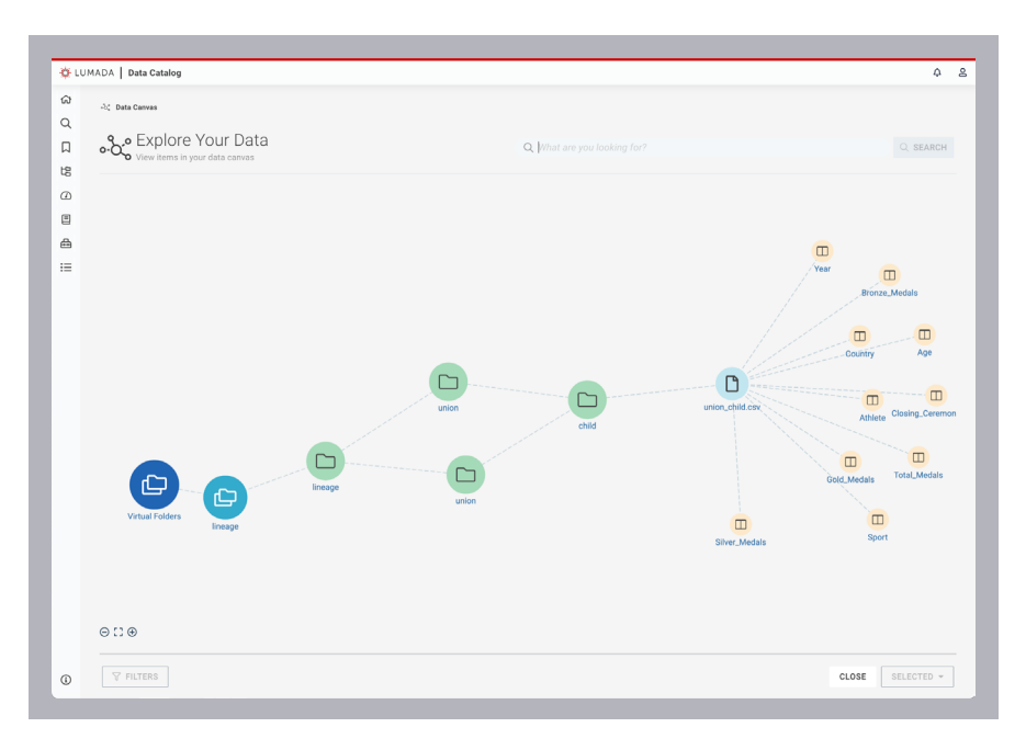
Figure 2: Accelerate insights with trusted data