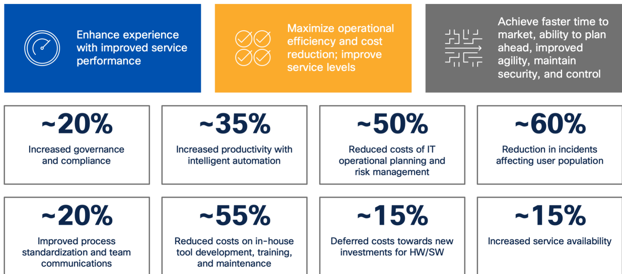
Figure 1 Service-based business outcomes from Hitachi Vantara Managed Services