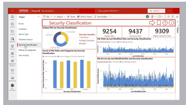
Fig.2 At-a-Glance Dashboard for Security Classification