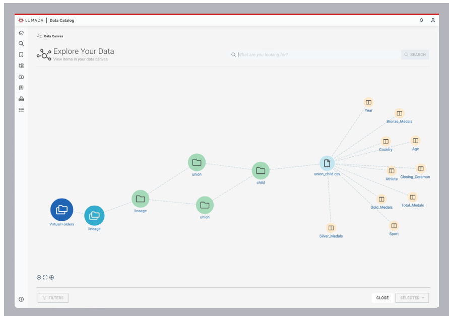
Figure 2: Accelerate insights with trusted data