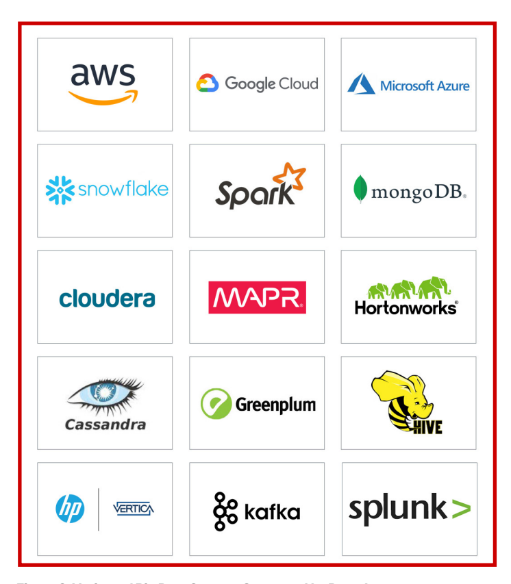
Figure 3. Variety of Big Data Sources Supported by Pentaho