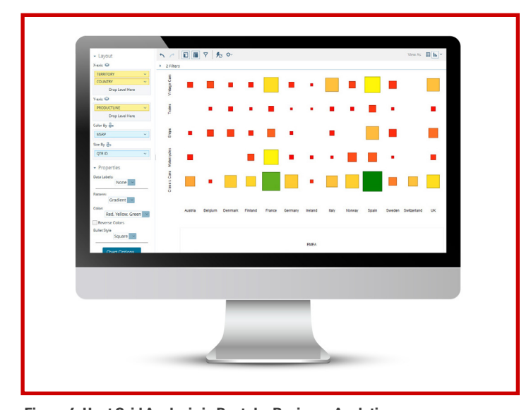
Figure 4. Heat Grid Analysis in Pentaho Business Analytics