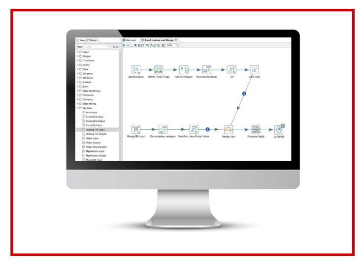
Figure 2. Drag-and-Drop Data Transformation in Pentaho Data Integration