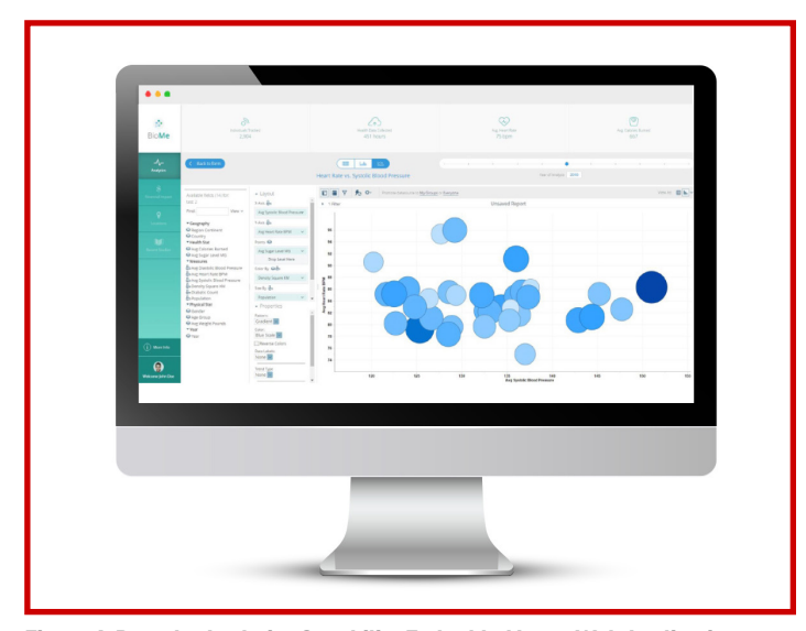
Figure 6. Pentaho Analytics Capability Embedded Into a Web Application