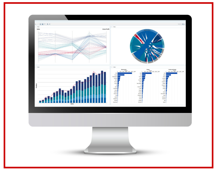
Figure 5. Intuitive Dashboard in Pentaho Business Analytics

Pentaho is now part of the Lumada DataOps Suite, which provides intelligent data management for digital innovation through advanced insights based on trusted data. The suite of products is open and modular to deliver Al-driven automation and collaboration, and includes: Lumada Analytics, Lumada Data Integration, Lumada Data Catalog, Lumada Data Optimizer for Hadoop, and Lumada Edge Intelligence. Lumada is built with Pentaho technology that includes Pentaho Business Analytics and Pentaho Data Integration.