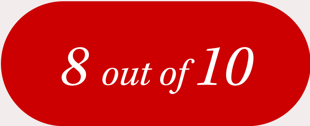
top banks use Hitachi Vantara