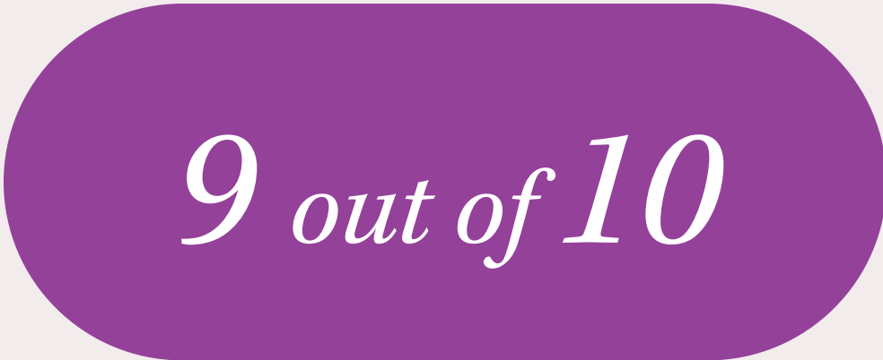
top health providers trust Hitachi Vantara