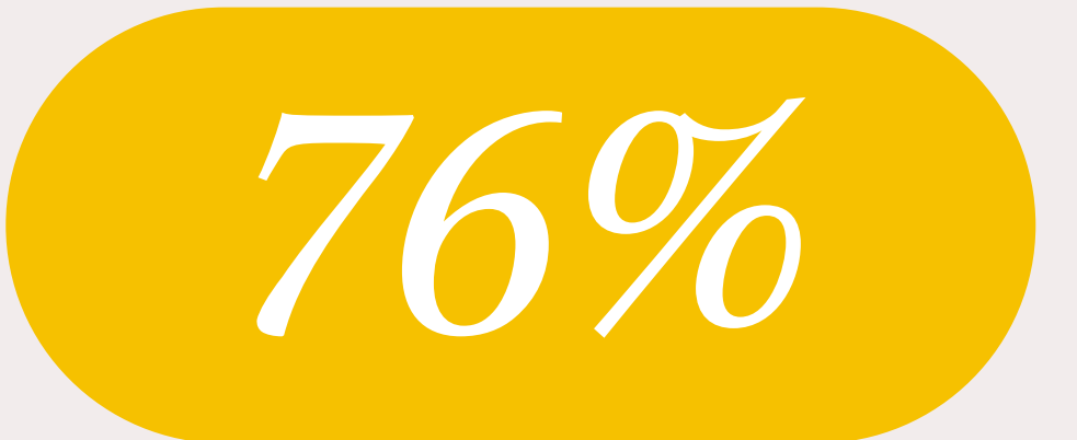
of Fortune 100 companies rely on VSP One for enterprise and cloud storage