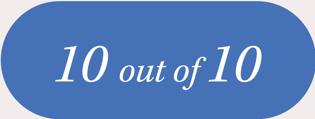
top telcos trust Hitachi Vantara