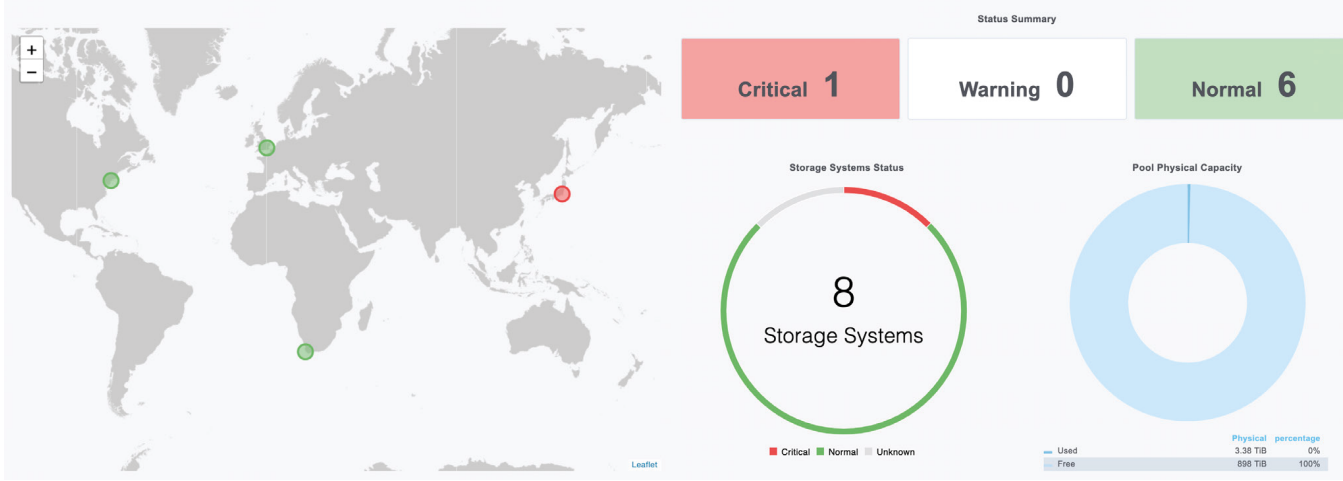
- Global Overview

*Hitachi chooses the location(s) where the SaaS offerings are performed, which may include countries outside of the borders of the country in which the customer and its systems are located.