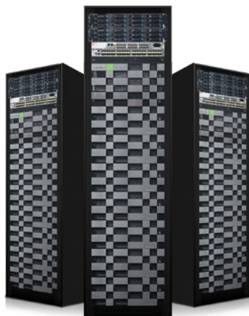
Figure 1. Hitachi Video Management Platform

Hitachi Video Management Platform is a key component of Hitachi Visualization Suite, a range of solution offerings that deliver on Hitachi Vantara's vision for public safety and smart cities. The VMP solution is a converged infrastructure offering of compute and storage that runs digital video management systems (DVMS or simply VMS). Today's VMS platforms need high-performing, scalable and highly available infrastructure solutions. Hitachi Vantara has packaged best-in-industry products, such as Hitachi Virtual Storage Platform G series (VSP G series), rack optimized server for solutions and Fibre Channel storage networking into a scalable, efficient and highly available appliance.