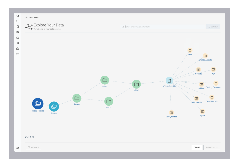
Figure 2: Accelerate insights with trusted data