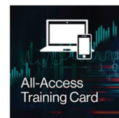
All streaming, on-demand courses Access to all Labs All Instructor-led classes