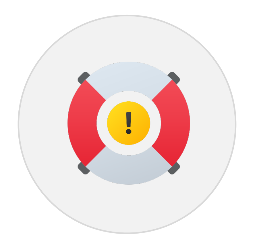
REPLICATION AND DISASTER RECOVERY