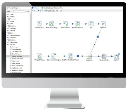
Figure 1: Drag-and-Drop Data Transformation in Pentaho Data Integration

Pentaho Data Integration's adaptive big data layer allows you to plug into popular big data stores with flexibility and insulation from change. Data can be accessed once, then processed, combined and consumed anywhere. The adaptive big data layer includes plug-ins for big data distributions and object stores from Cloudera, Hortonworks, MapR (HPE Ezmeral Data Fabric), Amazon Web Services, Google Cloud and Microsoft Azure, object stores such as Hitachi Content Platform, as well as popular NoSQL databases like MongoDB and Cassandra.