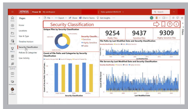
Fig.2 At-a-Glance Dashboard for Security Classification