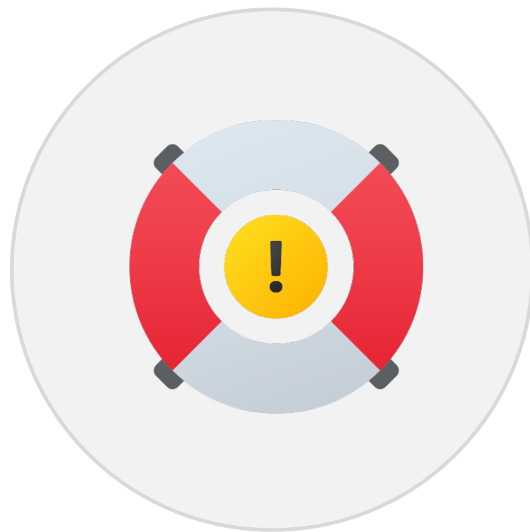
REPLICATION AND DISASTER RECOVERY